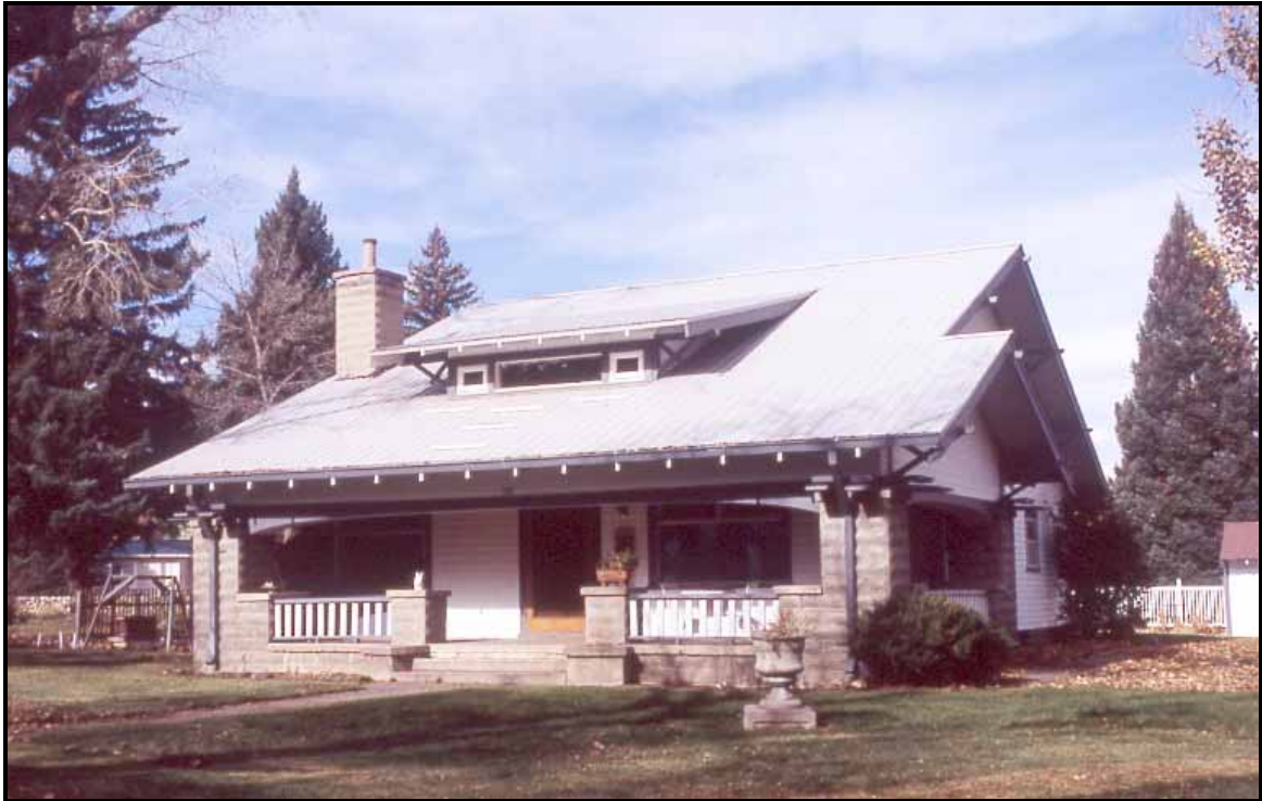
108 Park Place, 5CF2056, Hanks House (1907).