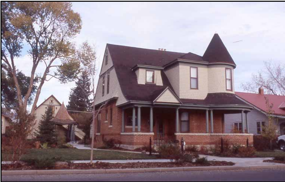
904 F Street, 5CF2049, Burns/Preston House (1900).