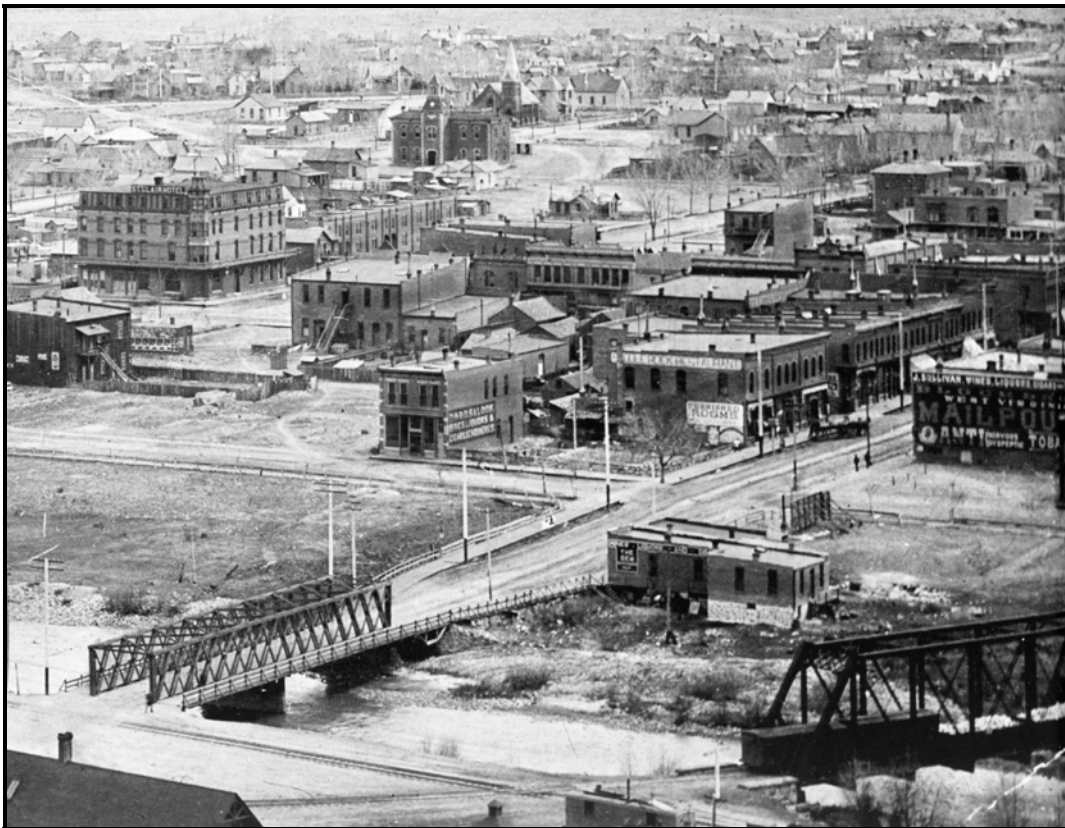
Figure 4. The intersection of N. F Street and Sackett Avenue with the Arkansas River in the foreground is featured in this circa 1895 photograph. Developing residential neighborhoods spread beyond the commercial district.

clothing and shoe stores, mercantiles, department stores, dry goods stores, office buildings, groceries and meat markets, paint and wallpaper firms, and hardware stores. North or Lower F Street's location nearer the railroad facilities made it a popular spot for hotels, rooming houses, restaurants, saloons, barbers, and tobacconists, as well as a variety of other occupations found on the south end of the street. First Street attracted a diverse selection of businesses, including furniture and undertaking establishments, restaurants, a newspaper office, several boarding houses, a grocery, a harness shop, millinery and shoe stores, a barber shop, saloons, offices, an opera house and a theater, a second hand store, a general mercantile, a laundry operation, and a hotel. Front Street (Sackett) would attract several hotels and boarding houses, a saloon, storage buildings for businesses, and a large red light district.