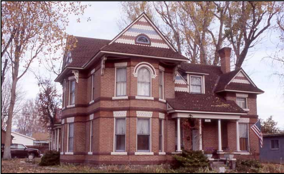
846 F Street, 5CF2048, Alexander/Churcher/Gloyd House (1901).