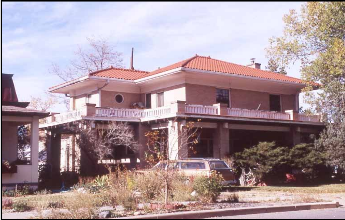
408 F. Street, 5CF2042, Cochems House (1912-13).