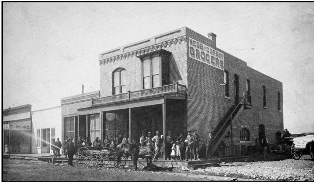
Figure 3. The two-story Webb and Corbin Wholesale Grocery building (on the right at 122 N. F Street) and the one-story building adjacent to it (118 N. F Street) are shown in this 1884 photograph. The two structures survived the 1886 fire.

The location of the town insured its success. Nearby were plentiful deposits of iron ore, copper, and fire clay, as well as several mining districts. The Barlow and Sanderson stage line operated between Cañon City and Salida before the railroad arrived, and between Salida and Leadville and Salida and Gunnison until the iron horses reached those communities. The town’s potential role as the supply and service hub for the surrounding region and for those who would pass through on the railroad quickly attracted a variety of businessmen and merchants who purchased lots and erected buildings. The railroad arrived on 1 May 1880, and a temporary depot was created in a boxcar that opened on 20 May. Within a few weeks, the town experienced substantial growth, much of it coming from people abandoning Cleora. 16