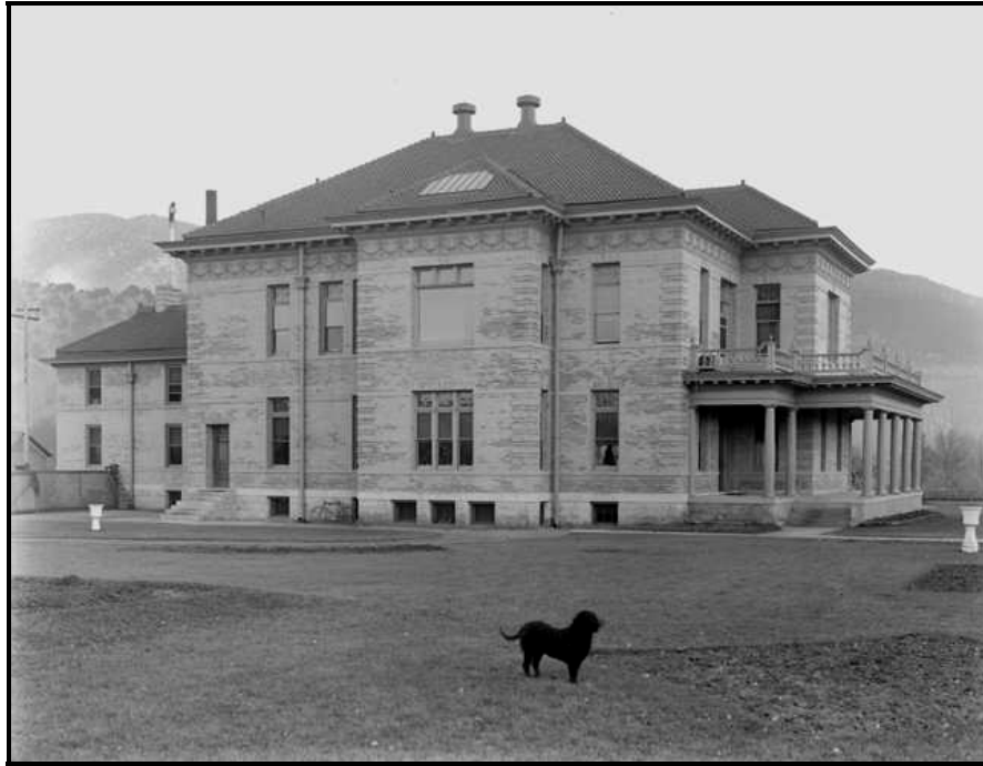
Figure 8. A new Rio Grande Railroad Hospital was constructed in 1900, using the foundation of the building that burned.

that had previously dominated commercial construction in the city. The building did not include tall, narrow, segmental arched windows with hood molds that were an essential part of the city's nineteenth century architecture, but featured flat arch windows with transoms and stone courses. The building exhibited three divisions: a red sandstone base, a buff brick second story, and a crowning cornice ornamented with swags and moldings. A low pediment elaborated the main entrance on the beveled corner, which also featured a clock at the top of the wall. Tall stone columns supporting a pediment flanked the side entrance to the Knights of Pythias hall. Immense plate glass display windows faced F and Second streets.