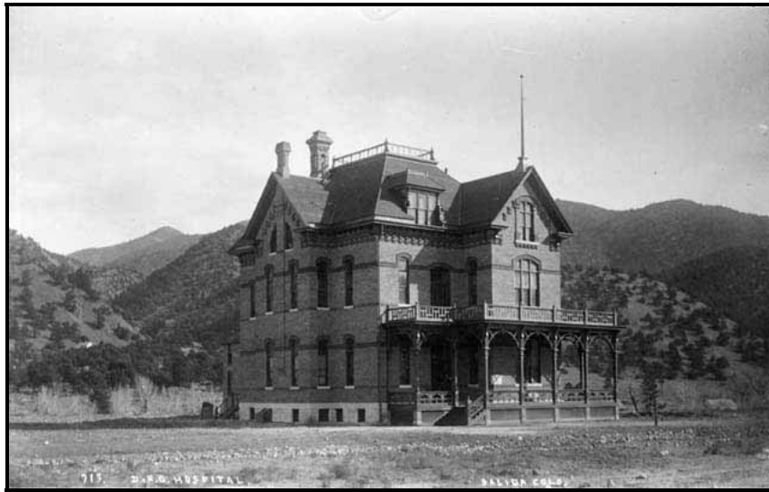
Figure 5. The first Denver & Rio Grande Railroad Hospital in Salida was erected in 1885, as one element in an expansion of railroad facilities in the town.

An important milestone in the history of Salida came in 1883, when the D&RG connected with the Denver & Rio Grande Western Railway (D&RGW), and Salida became a division point on the major east-west railroad. This role in the railroad system insured substantial employment that encouraged further growth. The railroad employed a force of 150 men building new machine shops, stockyards were erected, and Salida became a feeding and transfer point on the railroad. A subsidiary of the Rio Grande completed the $38,000 Monte Cristo Hotel and Eating House in 1883. The Monte Cristo featured both lodging and dining facilities, as the trains then did not include dining cars. Passengers on all trains on the main line and the Leadville division stopped at the hotel for meals. The three-story frame building included a soaring octagonal tower so that visitors could observe the beautiful scenery as well as the rail yards. When completed, the hotel was described as “a very substantial and elegant structure. . .the finest one on the line of the road between Denver and Salt Lake.” The hotel featured all modern conveniences, including hot and cold water in all rooms and steam heat. In its 1884 New Year’s edition, the Rocky Mountain News remarked that Salida “is a grand young city. . . .” 24