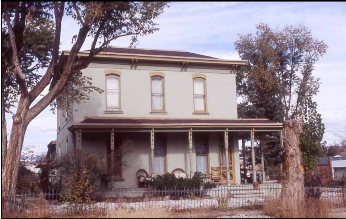
506 G Street, 5CF2055, Collins/Demphy House (1888-92).