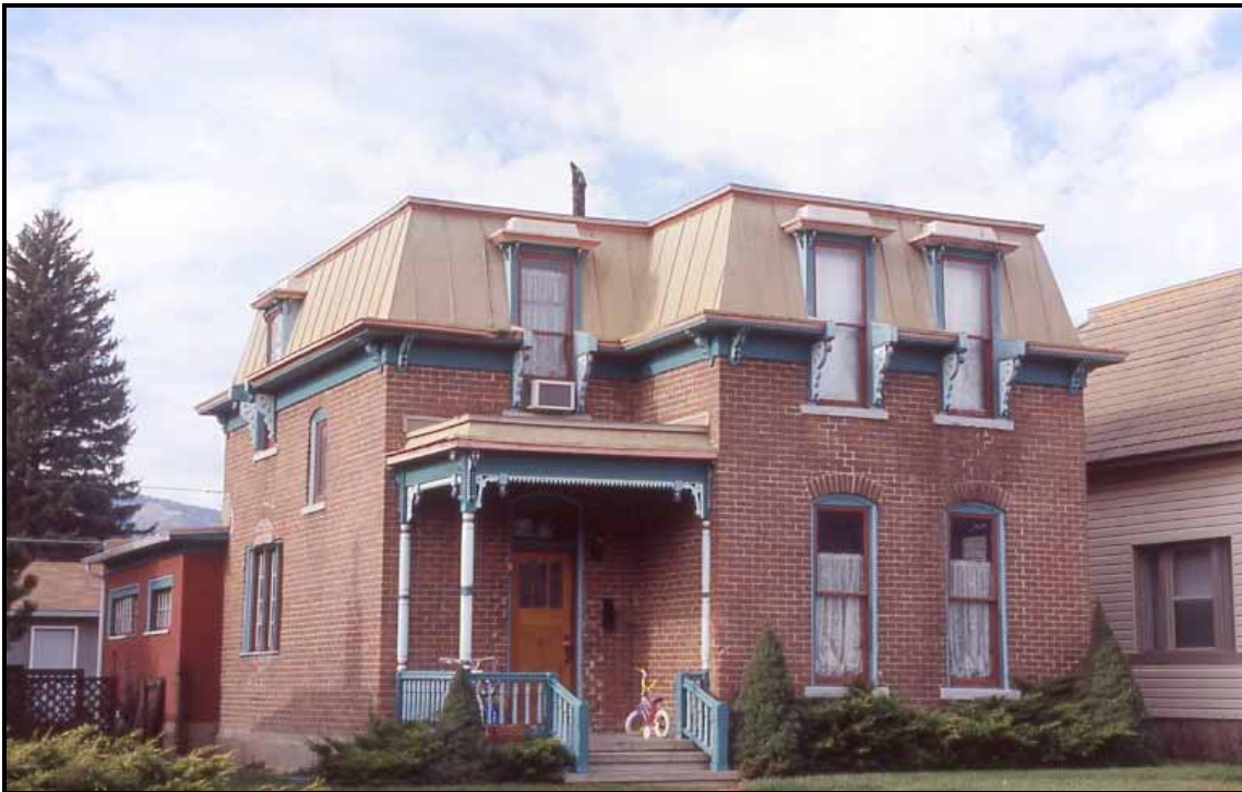
415 E. Second Street, 5CF2057, Graf/McNamara House (1885-1895).