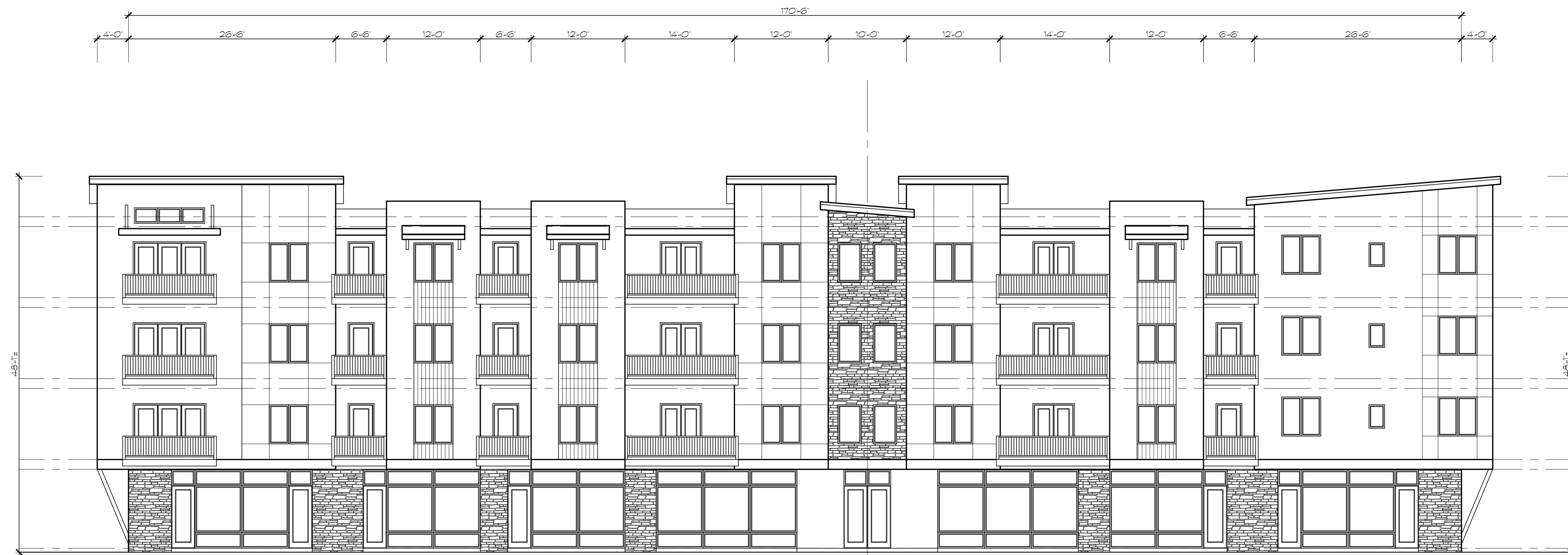
1 EAST / WEST ELEVATION BUILDING B & C 1/8" = 1'-0"