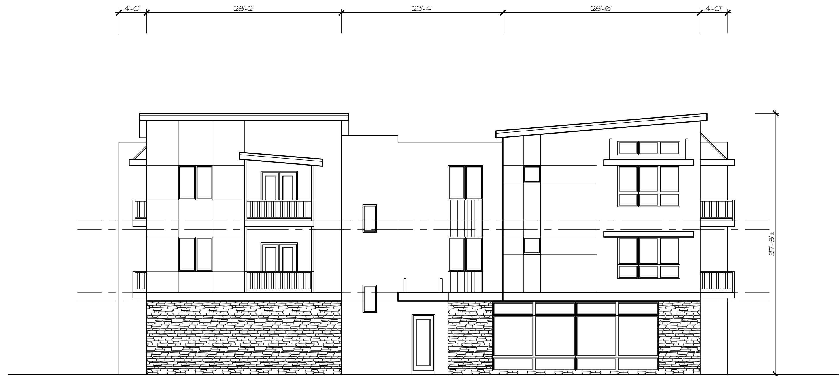
2 WEST ELEVATION BUILDING A 1/8" = 1'-0"