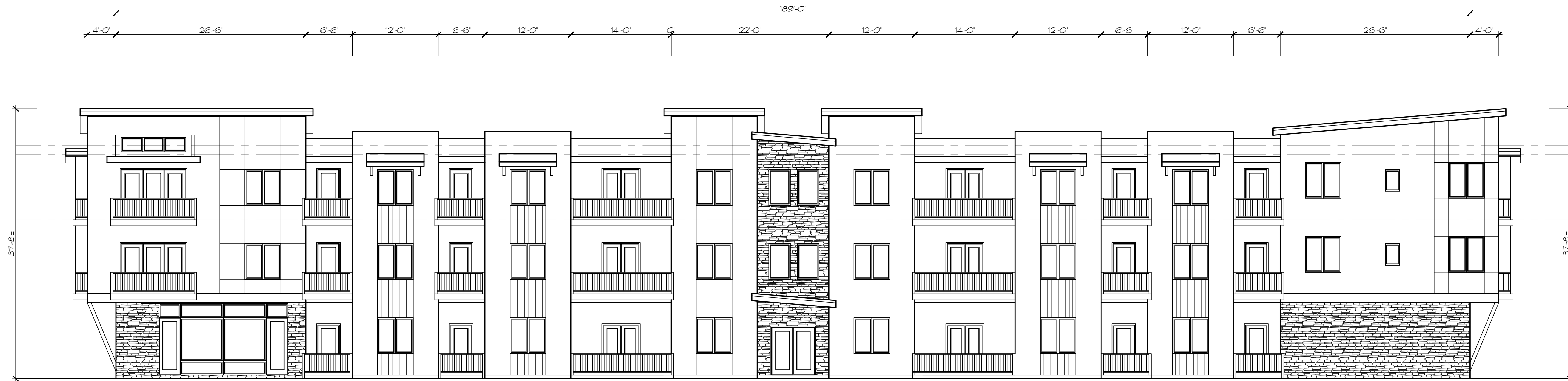
2 NORTH ELEVATION BUILDING A 1/8" = 1'-0"