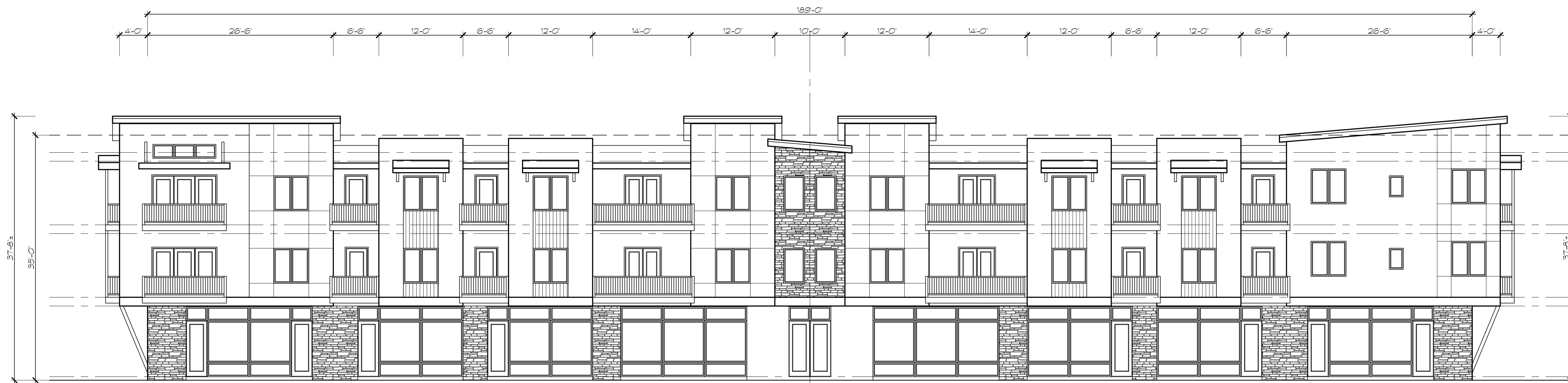
1 SOUTH ELEVATION BUILDING A 1/8" = 1'-0"