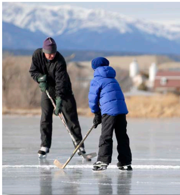
Ice hockey on Frantz Lake.

Action R&OS-II.1.a – Create guidelines and formalize process for the responsibility of the Board to