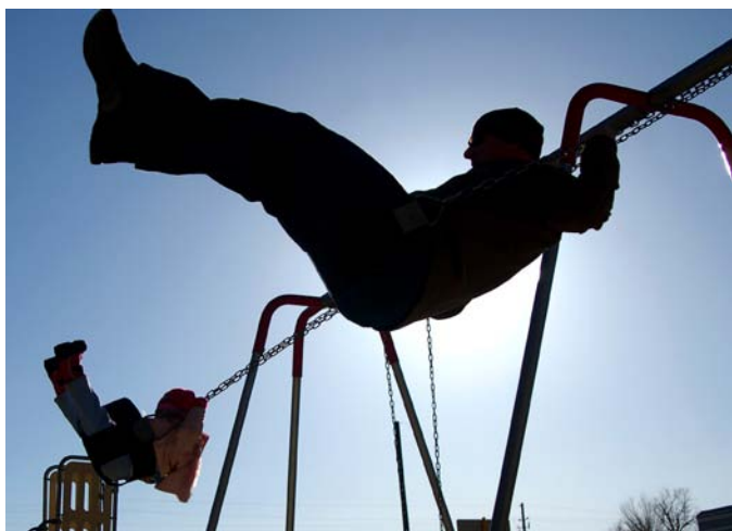
Riverside swing set

The 2009 Community Survey ranked Recreational Amenities third behind Small Town Atmosphere and Climate as the top reasons why residents choose to live in Salida. The City of Salida retains a year round staff to maintain and provide recreation programs in the community. There are over 16 city owned parks and facilities. The Public Works Department and the Recreation Department have been charged with the task of providing staffing to fulfill these positions within the City. Currently, two full time employees and two seasonal employees (Memorial Day to Labor Day) from the Public Works Department maintain the city’s parks and trails. The Recreational Department has one full time director and over 35 part time employees that staff the Aquatic Center and provide activities and events throughout the year.