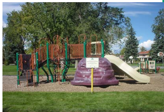
New playgorund equipment at Alpine Park

Action R&OS-IV.2.b - Continue to provide community support funding for projects brought forward by local organizations with demonstrated community support.