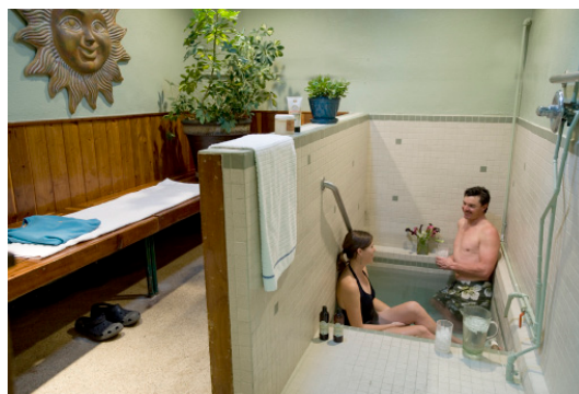
Remodeled soaking pools at the Salida Aquatic Center

Action R&OS-IV.2.b - Continue to provide community support funding for projects brought forward by local organizations with demonstrated community support.