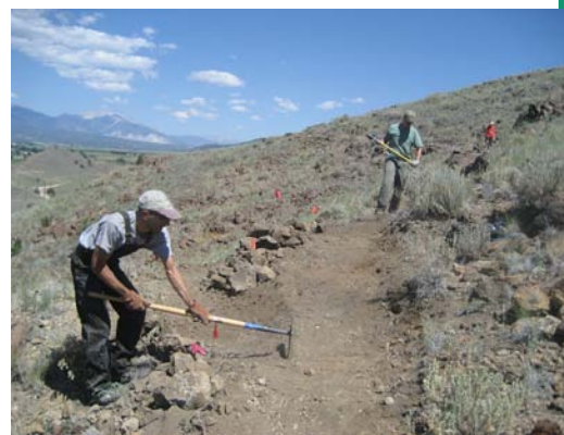
Salida Mountain Trails- Frontside Trail being built by local volunteers

Action R&OS-IV.3.a – Continue to work to help implement the land management plans of the Bureau of Land Management, State Parks, Forest Service and Division of Wildlife and establish working partnerships to help with their goals of preservation and wilderness awareness.