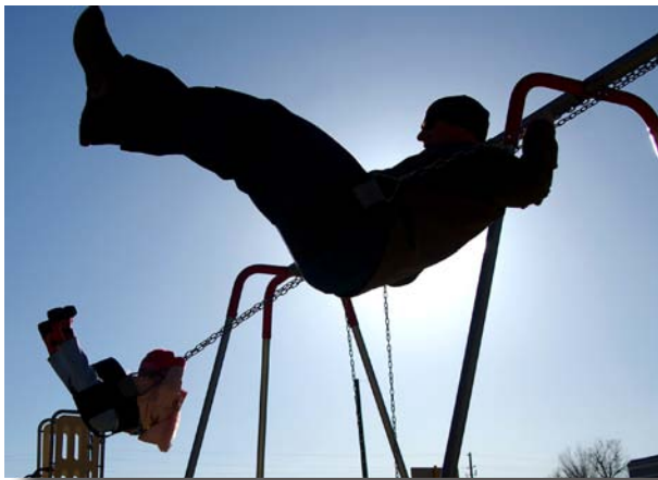
Riverside swing set

The 2009 and 2013 Community Survey ranked Recreational Amenities third and fourth behind Small Town Atmosphere, Climate, and Friendliness as the top reasons why residents choose to live in Salida. The City of Salida retains a year round staff to maintain and provide recreation programs in the community. There are over 16 city owned parks and facilities. The Public Works Department and the Recreation Department have been charged with the task of providing staffing to fulfill these positions within the City. Currently, 2 full time employees and two seasonal employees (Memorial Day to Labor Day) from the Public Works Department maintain the city's parks and trails. The Recreational Department has one full time director and over 40 part time employees that staff the Aquatic Center and provide activities and