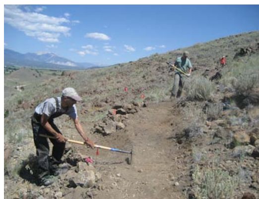
Salida Mountain Trails- Frontside Trail being built by local volunteers

Action R&OS-IV.3.a – Continue to work to help implement the land management plans of the Bureau of Land Management, State Parks, Forest Service and Division of Wildlife and establish working partnerships to help with their goals of preservation and wilderness awareness.